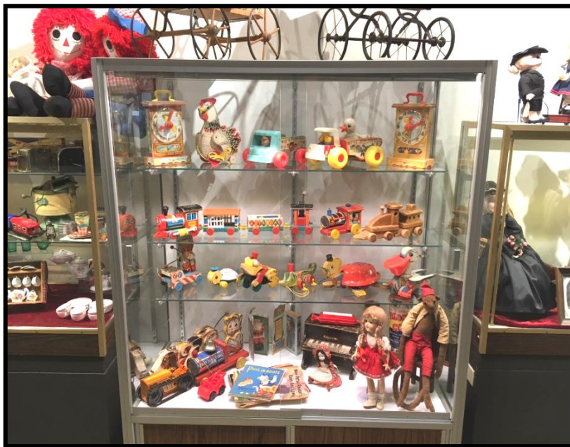
Kathy behind one of the cabinets she donated. One of her cabinets contains a permanent display of toys.