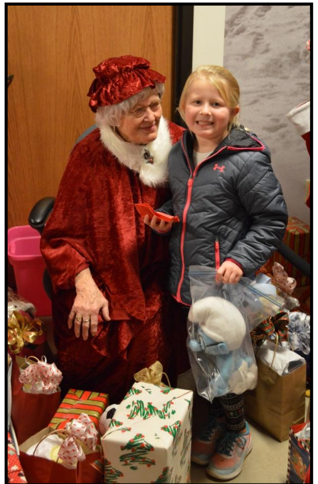
Mrs. Santa Claus had 92 presents wrapped for the children.