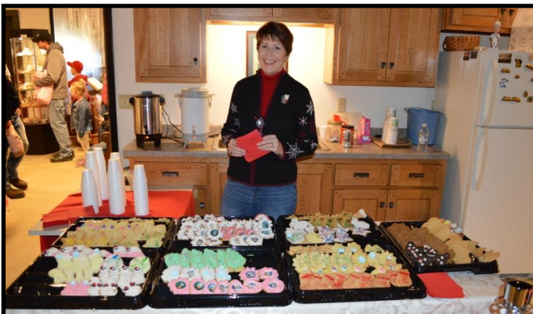
Christmas cookies were a big hit.