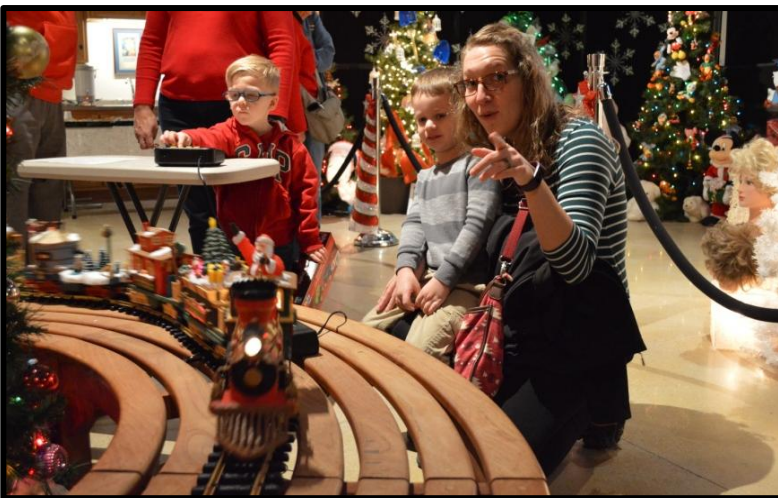
Kids had the opportunity to be the engineer on the Christmas train.